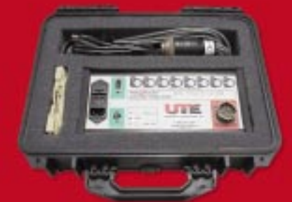
Single Node System

Relay Master™ Connecting into Customer's Needs.