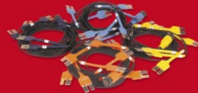
Octacon Cables With Paddles