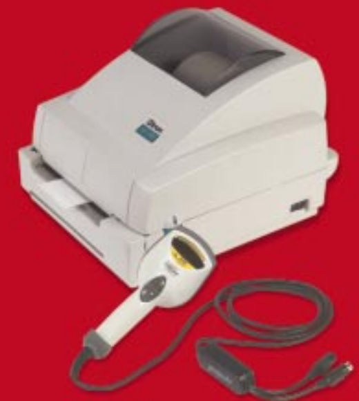
Bar Code Printer & Scanner