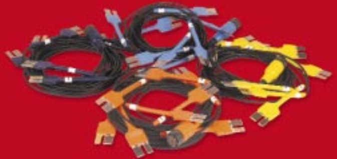
Octocon Cables With Paddles